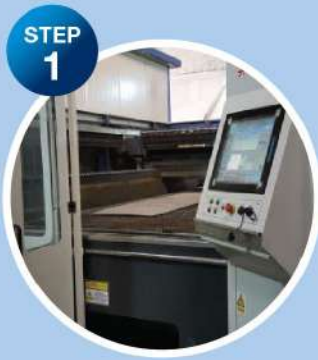
Plate CNC Cutting