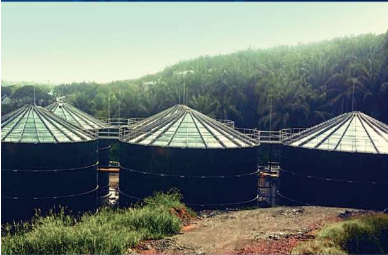
Palm Oil Wastewater Treatment Plant, Sandakan