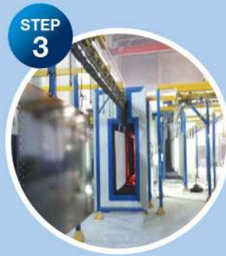
High Temperature Burning