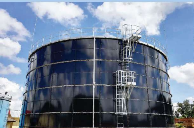
Wastewater Treatment Project, Indonesia