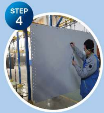
Quality Inspection 1500 V Holiday Test