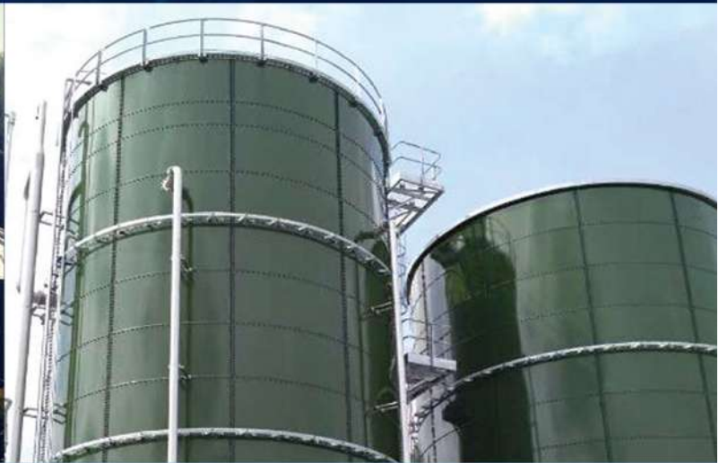
Coca-Cola Plant Wastewater Treatment, Seremban