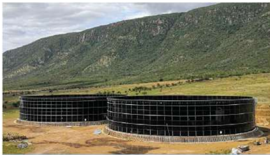
Anaerobic Digester GFS Tanks, Swaziland

Glass-Fused-to-Steel is two materials - Enamel frit and raw steel are fused together after high temperature firing at 820-930°C to achieve the best cohesion blending of the strength and flexibility of steel combined with the corrosion resistance of glass. Applied to both interior and exterior surfaces, Glass-Fused-to-Steel is able to provide many years of trouble free service in harsh environments.