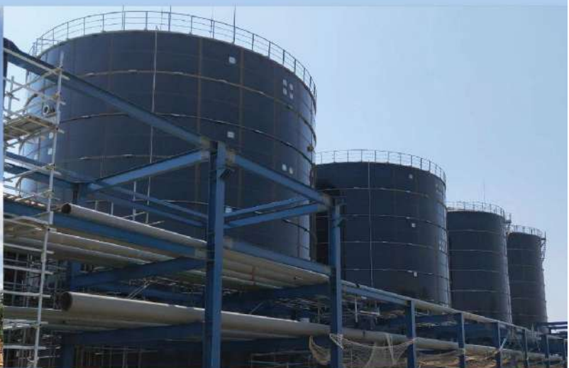
Sinopec Wastewater Treatment, Quanzhou